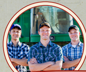
THE PETERSON FARM BROTHERS

Guyler-Alaniz founded FarmHer in 2013 to change the image of agriculture and to include women in that image through photographs and stories. Today, FarmHer has grown from a gallery of images that have changed the way people perceive a farmer to now include an online community, connecting women together, and a weekly TV show on RFD-TV. The show continues to shine light on women in agriculture through their stories featured in the FarmHer TV show.